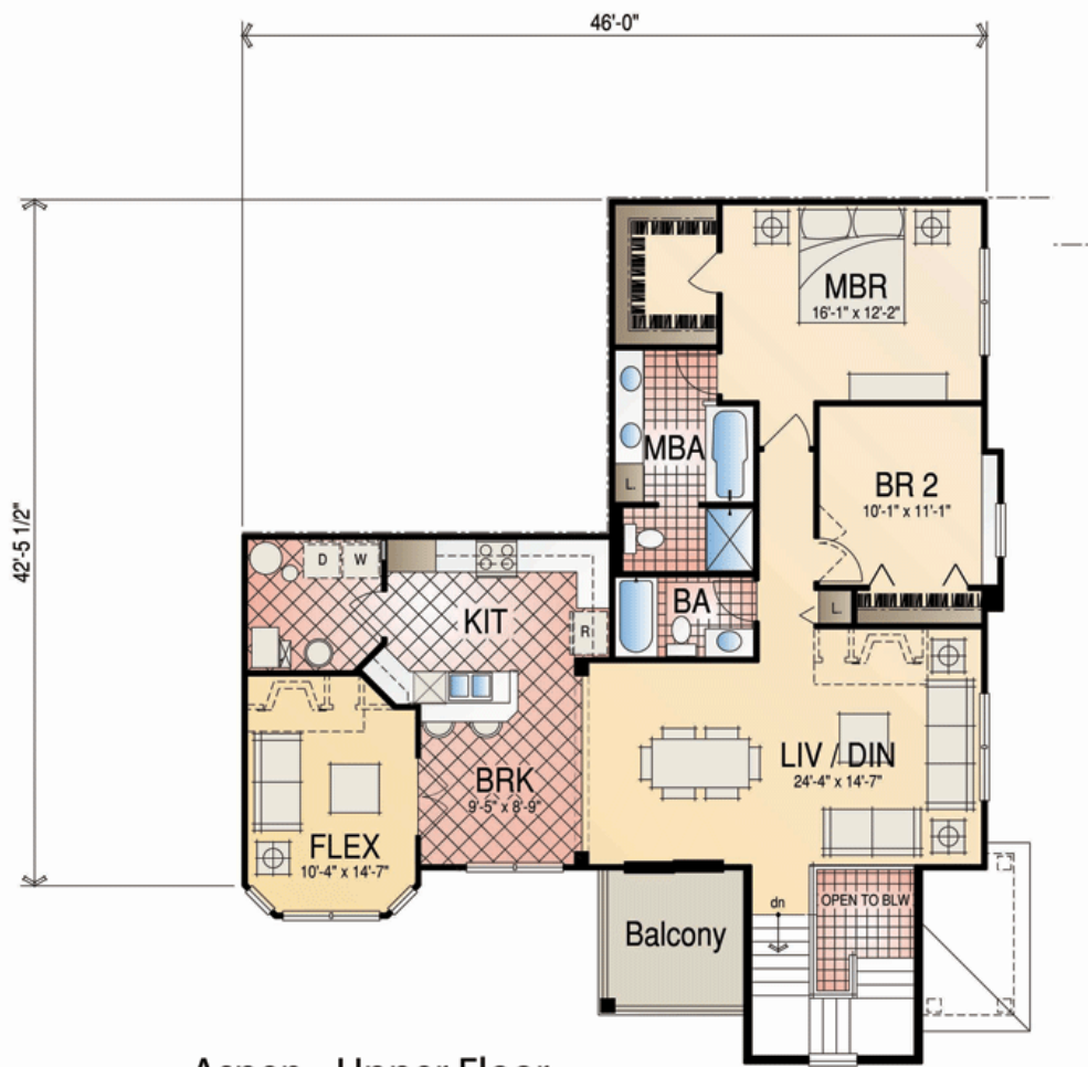
Aspen - Upper Floor 1/4"=1'-0" 1612 s.f.