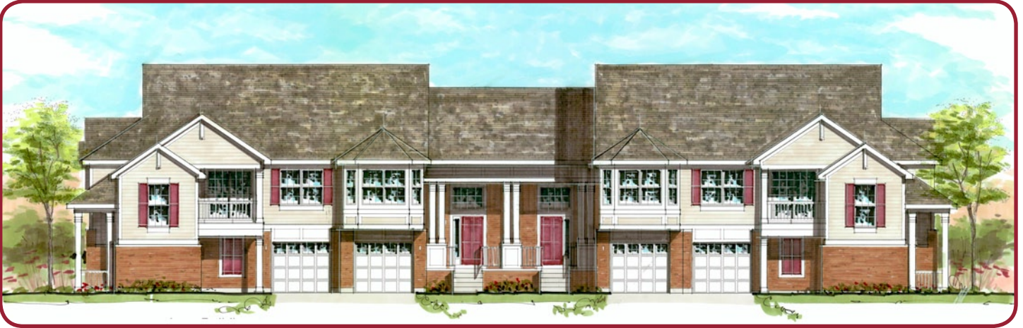
Elevation A – 6 Unit