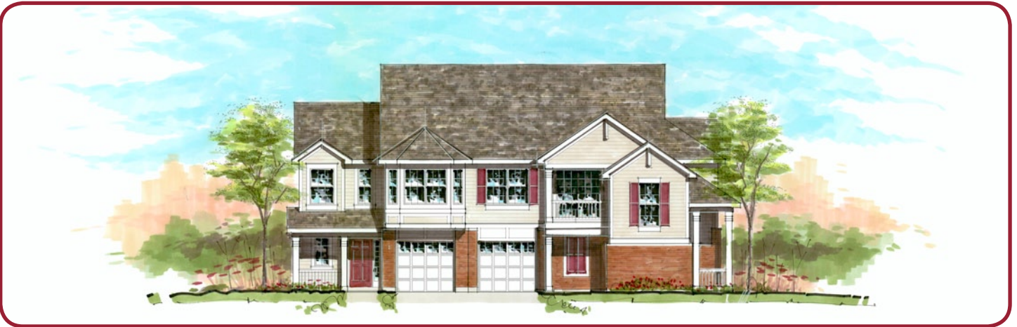
Elevation B – 3 Unit